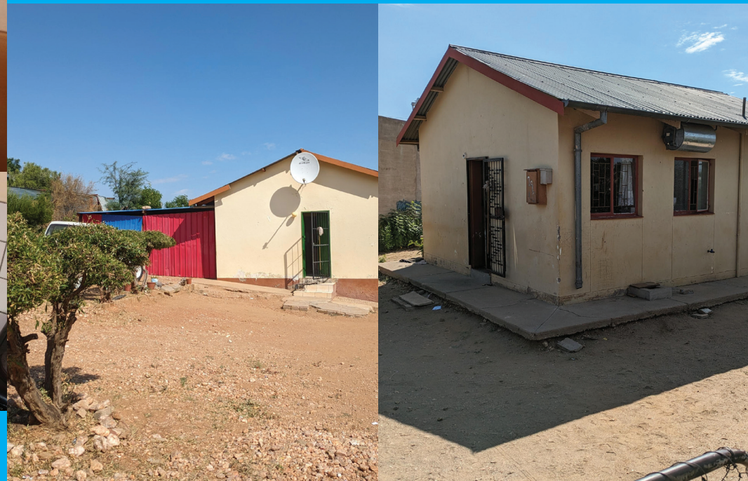
Community-based homes in Windhoek that need essential updates and furnishings for the wellbeing of children in our care.