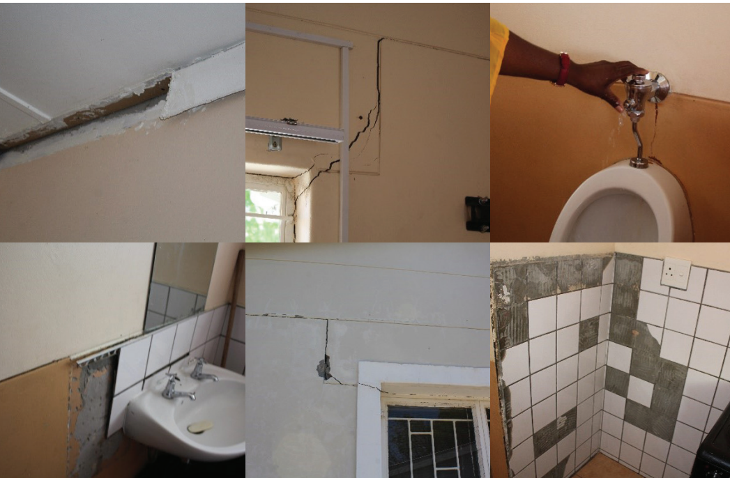
Family homes at SOS Children's Villages in Ondangwa that need essential repairs for the wellbeing of children in our care.

After the successful reintegration of children with their biological or extended families, additional space to support more children in need will be created. SOS mothers, staff, and families in the community will be provided with specialized training.