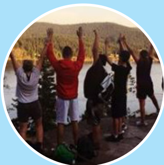
SOS Children's Village BC Youth