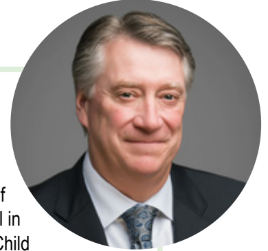
Senator Scott Tannas

Our SOS International Ambassador toured across Canada in 2018, helping to raise more than $150,000 and grow our community.