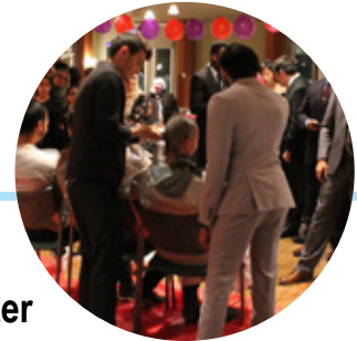
McMaster University Muslim Student Association

Students raised $25,000 as part of the McMaster Orphan Sponsorship Program.